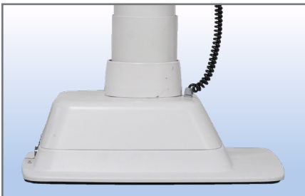
Exclusive telescoping hydraulic cylinder system