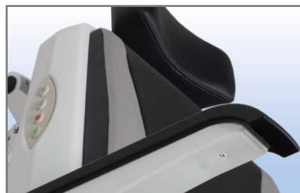
Ergonomically designed arms rotate up for patient flexibility.