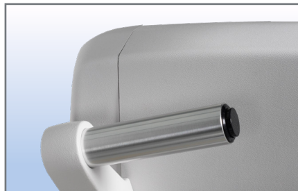
Angled push-button recline handles for easier reclining motion