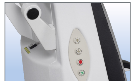
Overlay switch panels on both sides of the chair for convenient fingertip adjustments.