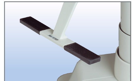
Foot-activated rotation lock can easily be activated from both sides of the chair