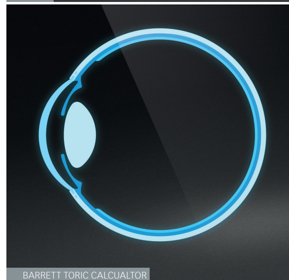
BARRETT TORIC CALCULATOR

The Barrett Toric Calculator is based on the Barrett Universal II formula and features a unique model of the human eye to predict the posterior radii of the cornea. First Clinical data presented at the ESCRS 2014 proves the effectiveness of the Barrett approach as compared to other toric calculation methodologies. In addition EyeSuite IOL is providing an incision optimisation tool to further improve the refractive outcome of the procedure.