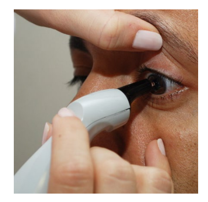
PachPen in Use