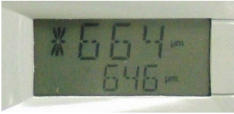
Figure 3.4 - Speed of Sound Screen