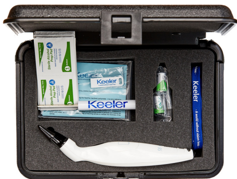
Figure 3.1 - PachPen Unpacked