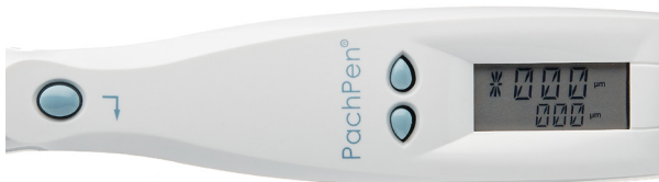
Figure 3.3 - Action Control Buttons and LCD