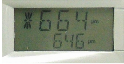
Figure 3.6 - Measurement Screen Starting New Patient