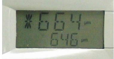
Figure 3.7 - True IOP Screen

Table 3.1 provides the IOP correction values.