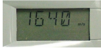
Figure 3.5 - Measurement Screen