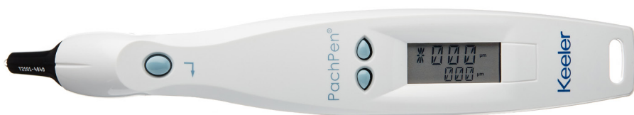
Figure 1.1 - PachPen Pachymeter

The Keeler PachPen pictured below has all the features that make it easy to obtain extreme accuracy and improved patient outcomes.