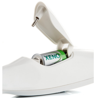
Figure 3.2 - Battery Insertion